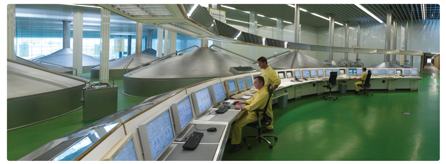
The modern: The control room at the Warsteiner plant set in the Arnsberger Forest Park about 60km east of Dortmund in Northwest Germany.

example, what Heineken achieved with their BEAMS (Brewery Equipment Automation Modules Standards) interpretation of the S88 standard for beer processing, or in the information space, the Weihenstephan standard for Packaging Line Data Acquisition on bottling lines. However, even with the definition of good brewing automation standards being in place, it does not necessarily mean a successful automation project. If the control philosophy being applied does not have the required level of instrumentation on the brewery, then the level