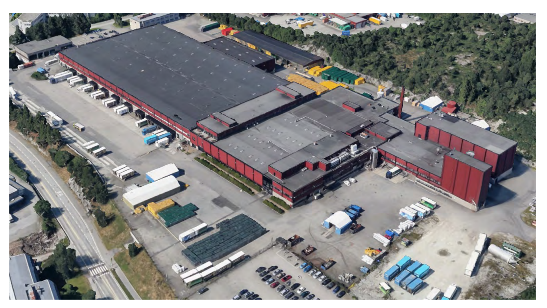
View of the factory

However, the aging system, including the control cabinets and peripherals, was calling out for modernization, leaving no alternative but to upgrade it. The proposed project not only included upgrading brewmaxx but also replacing all the I/O cards.