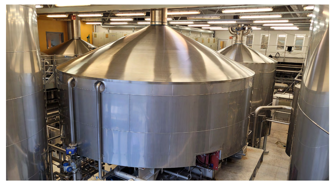
Hansa Borg Brewhouse

The central recording of all measurements, alarms, and messages ensures easy comparison and optimization options, leading to greater efficiency. Further, the central management of processes and parameterization through a sequence-controlled recipe system enable smooth and efficient production processes.