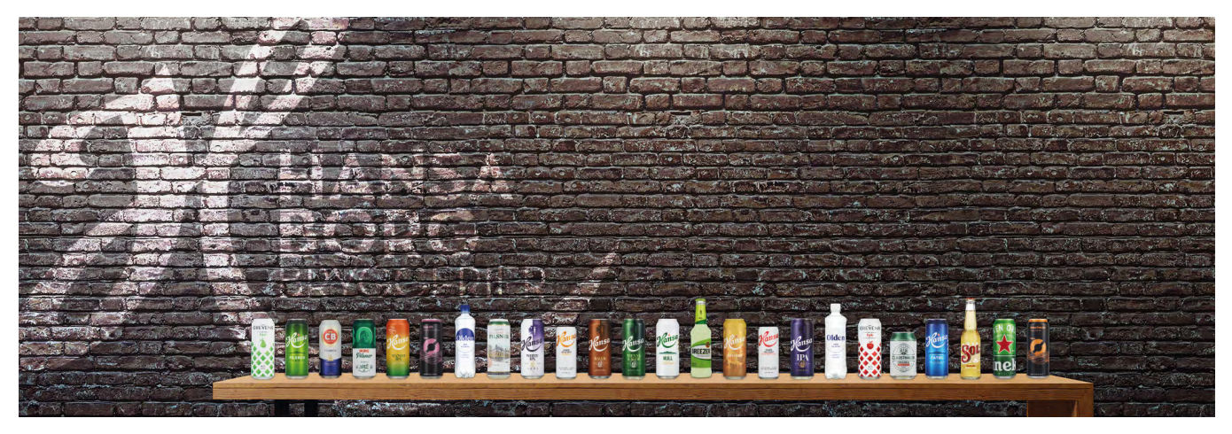
Product portfolio Hansa Borg

Since brewmaxx had already been installed as a central instance, integrating the entire building control system with the production processes became a key objective. To achieve this, the brewmaxx system was enhanced with the EnMS module.