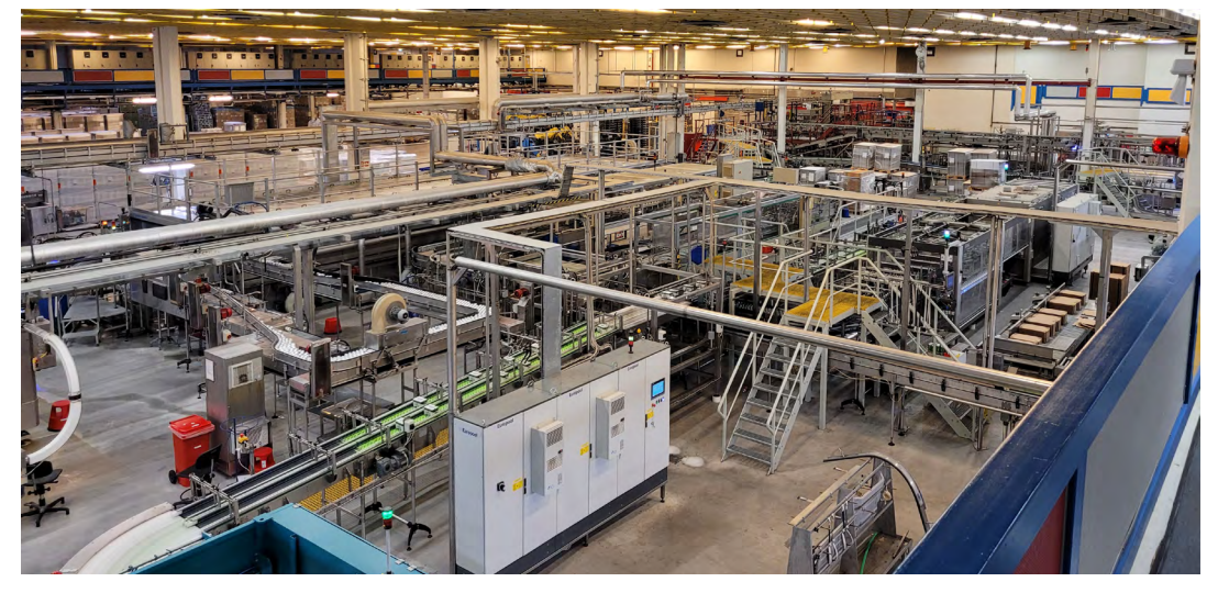
Filling at Hansa Borg

The process control system underwent a thorough modernization that included both the control cabinets and the I/O cards and has resulted in a cutting-edge plant.