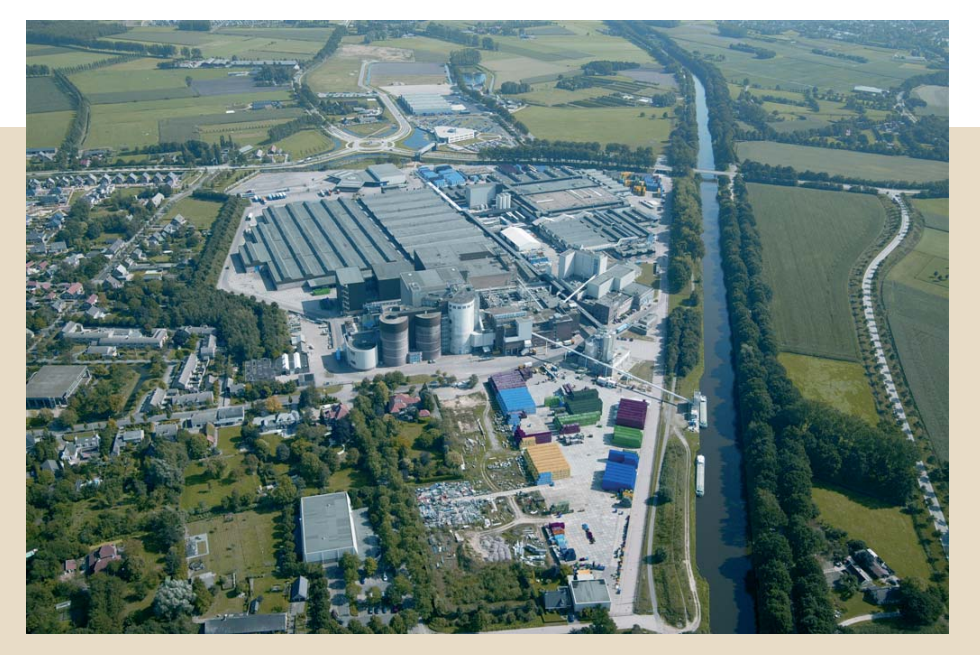
Fig. 2 Company facility

by the system as soon as the first tank is empty, and the filling plant continues to operate without interruption.