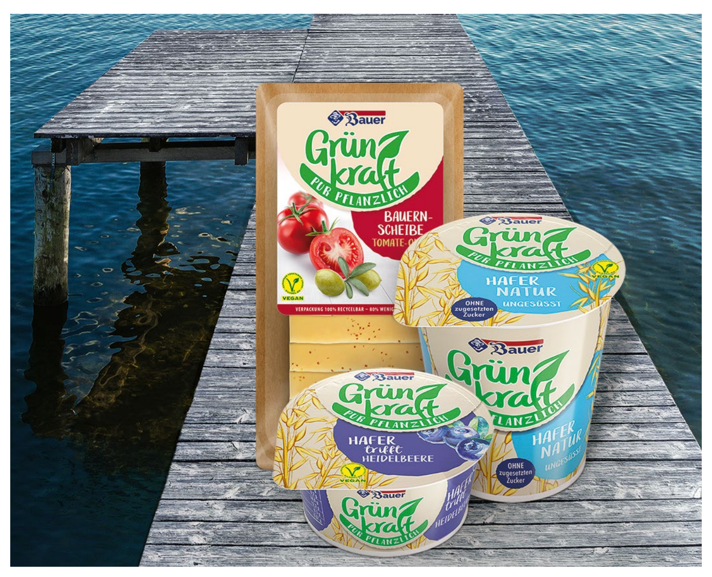
Bauer's "GrünKraft" competence brand

Needless to say, when the topic of a software update arose in 2018, the current version 9 was installed. In addition to many old and new functionalities, Bauer's focus was on continuing to use the tried-and-trusted standard software together with familiar visualizations.