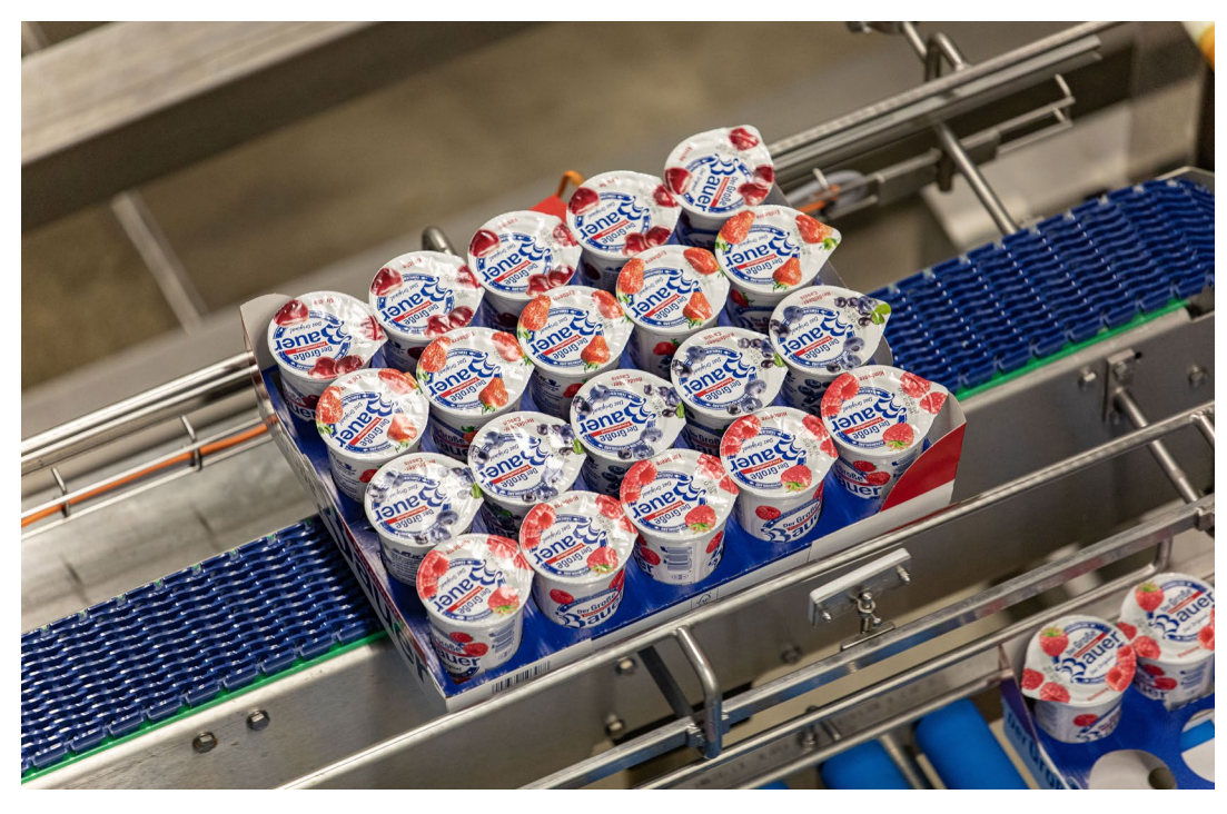
Production at Bauer

ProLeiT sales manager Bernd Opgenorth remembers a very special moment during the project: "Monitoring of the first milk delivery was actually scheduled for the commissioning phase. But the update was installed successfully in the background well before the end of the originally planned test phase. Which allowed raw milk delivery to continue without any disruption. Proving yet again that, in the end, it's all about the planning."