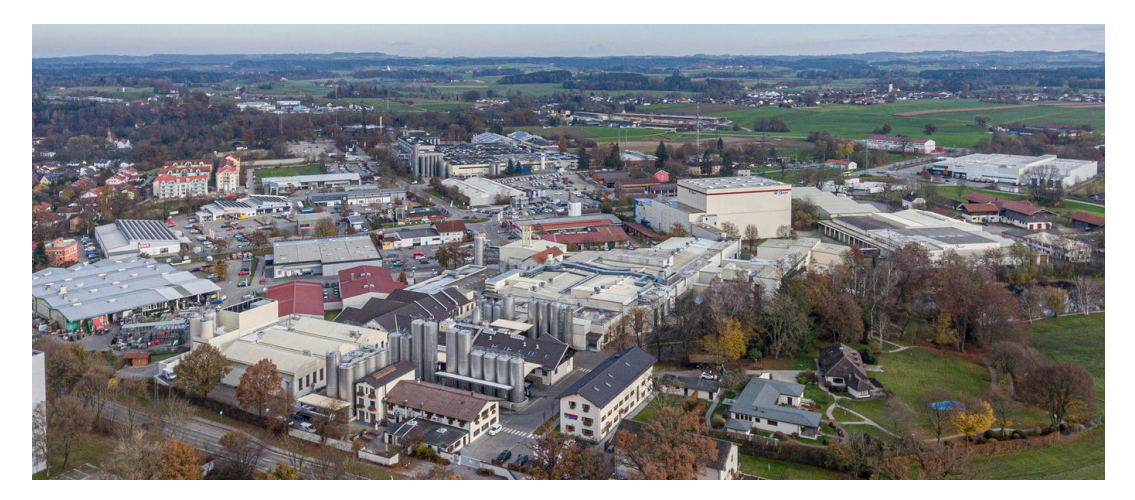
The plant in Wasserburg, Germany

But let's start at the beginning: The process control system Plant iT has been in use at Bauer since 2000. Automation commenced in the milk delivery sector with three computers on the S7 platform. And this was so successful, in fact, that a decision was taken in 2003 to fully replace the former Otas MD (MULTIDOS) system with Plant iT. After this, Bauer continued to automate its processes until Plant iT versions 6.00 and 7.12 were used across all business units.